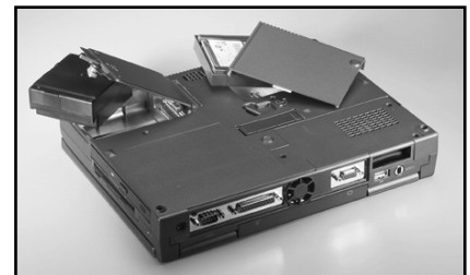
Easy access to hard drive and battery