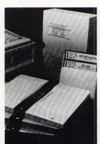
DOCUMENTATION AND SOFTWARE