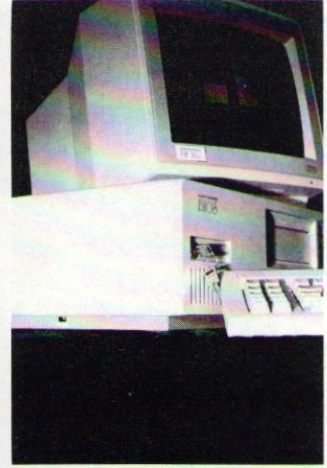
6 OR 8 MHZ SWITCH