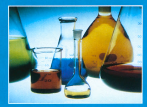
Truevision Advanced Raster Graphics Adapter, (TARGA 16)-512 pixels by 482 pixels (interlaced only) by 32,768 colors.