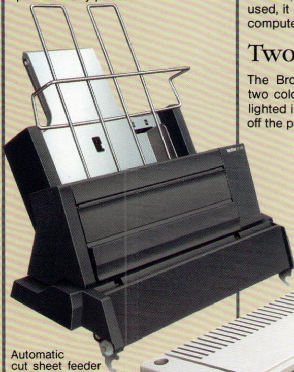
Automatic cut sheet feeder

The Brother HR-20 is an outstanding value. It produces excellent letter quality text and is compatible with all of the best selling personal computers and software. In addition to having a very attractive list price, the Brother HR-20 offers many unique user benefits not available on any printer at any price.