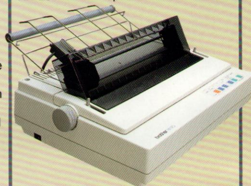
HR-20 with an optional tractor feeder

brother ® We put our reputation on paper.