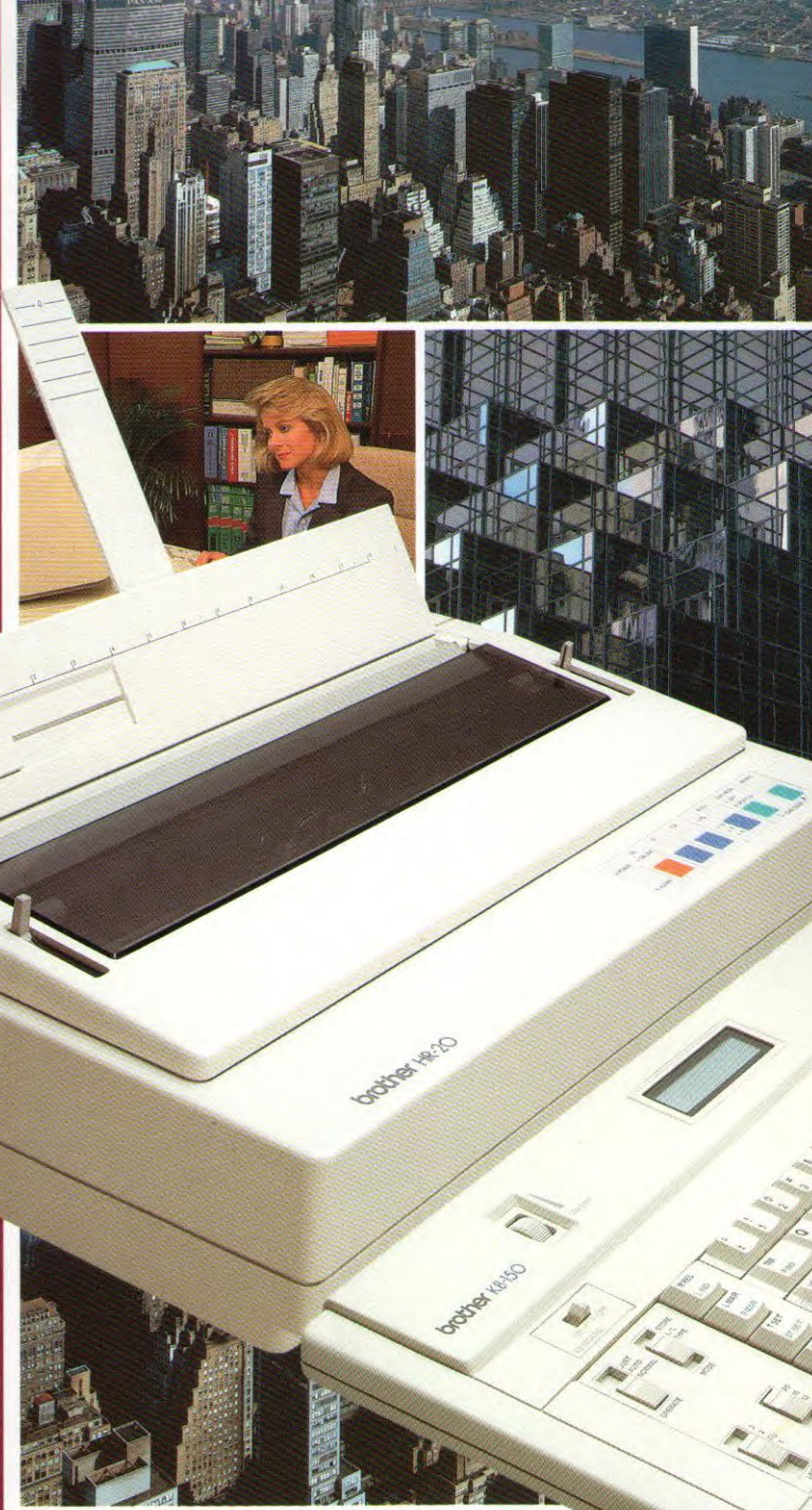
HR-20 with an optional keyboard

An affordable, state-of-the-art, feature rich letter quality printer for home and office