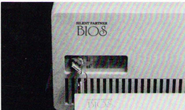
SECURITY KEY LOCK SWITCH