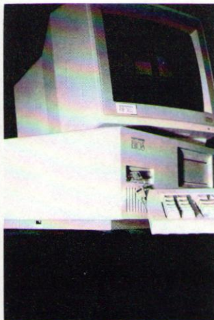
6 OR 8 MHZ SWITCH