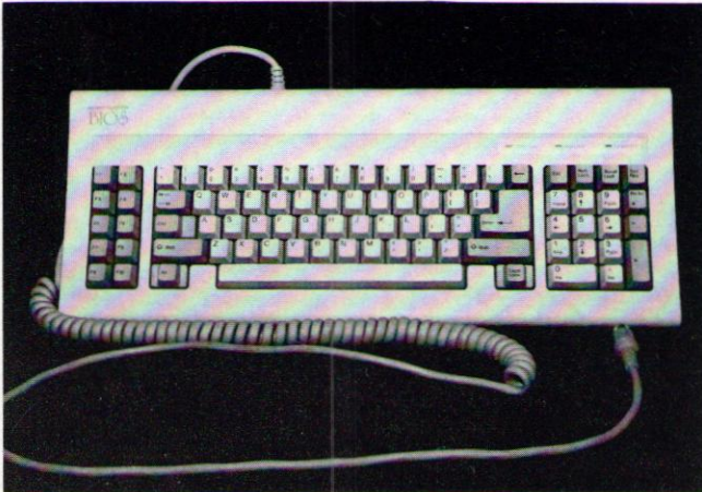
84 KEY AT™ STYLE KEYBOARD